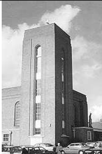
OUR LADY, QUEEN OF APOSTLES